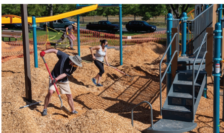
Rotary volunteers add finishing touches on May 23, 2020