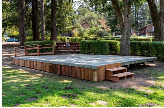
Completed Stage