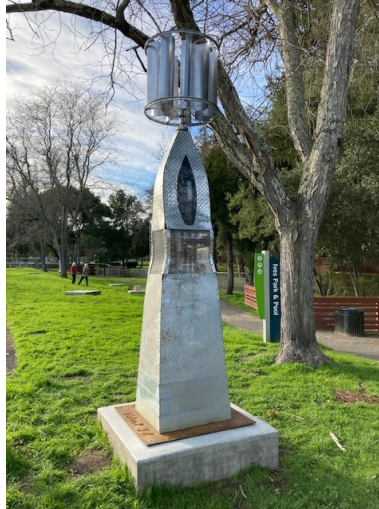
Zephyra Artist: Sculpture Jam