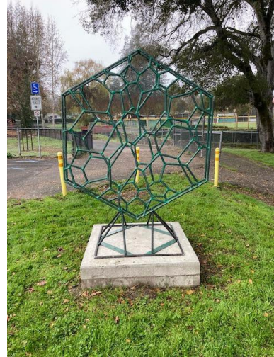
Medallion Artist: Briona Hendren

The Sebastopol City Council and its Public Arts Committee (PAC) invite Sonoma County-based artists to submit proposals for the new Community Sculpture Garden (CSG) located along the pedestrian walk between Ives Park's Calder Creek and the Sebastopol Center for the Arts. The CSG will eventually be comprised of eight sculptures. The first three sculptures were installed in January. Submission information may be found HERE . Submissions close April 15.