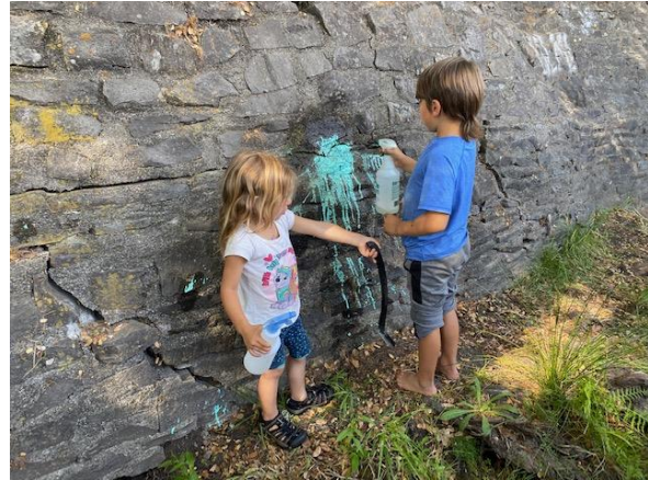
Two young members of the Sebastopol Graffiti Patrol.