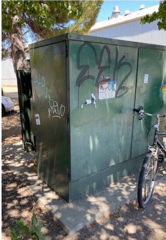
Typical tagging around town.

Thanks in advance, The Sebastopol Graffiti Patrol