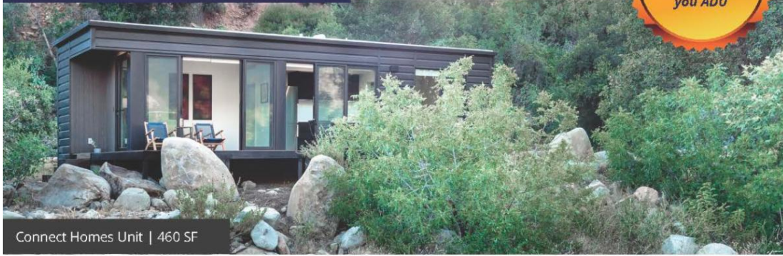
Connect Homes Unit | 460 SF