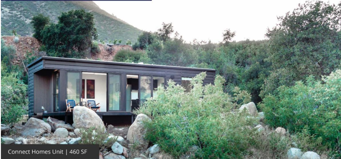
Connect Homes Unit | 460 SF