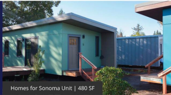
Homes for Sonoma Unit | 480 SF