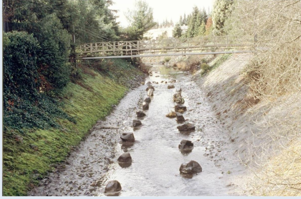
Santa Rosa Creek - Before