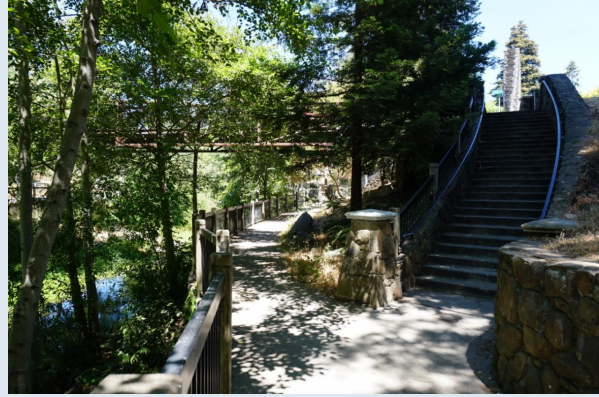
Santa Rosa Creek - After

These two photos are an example of a creek naturalization project with WRI and show Santa Rosa Creek near Rail Road Square in Santa Rosa in which the City took out a concrete flood control channel and restored the environment and public access.