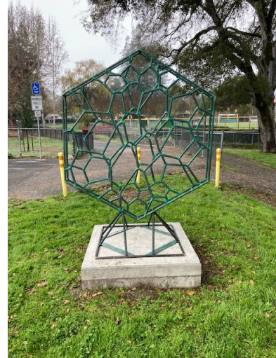
Medallion Artist: Briona Hendren

The Sebastopol City Council and its Public Arts Committee (PAC) invite Sonoma County-based artists to submit proposals for the new Community Sculpture Garden (CSG) located along the pedestrian walk between Ives Park's Calder Creek and the Sebastopol Center for the Arts. The CSG will eventually be comprised of eight sculptures. The first three sculptures were installed in January. Submission information may be found HERE .