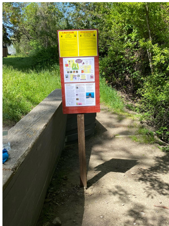
Tick awareness signage on Laguna trail.